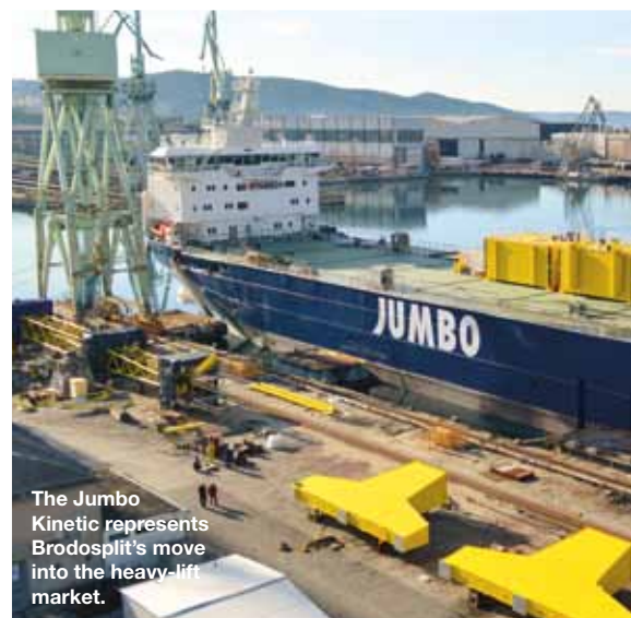
The Jumbo Kinetic represents Brodosplit's move into the heavy-lift market.